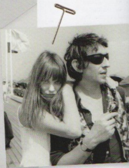
Art.com "Serge Gainsbourg and Jane Birkin, July 23, 1970" 16" x 16" photographic print $19.99 domino.com/free-spirit