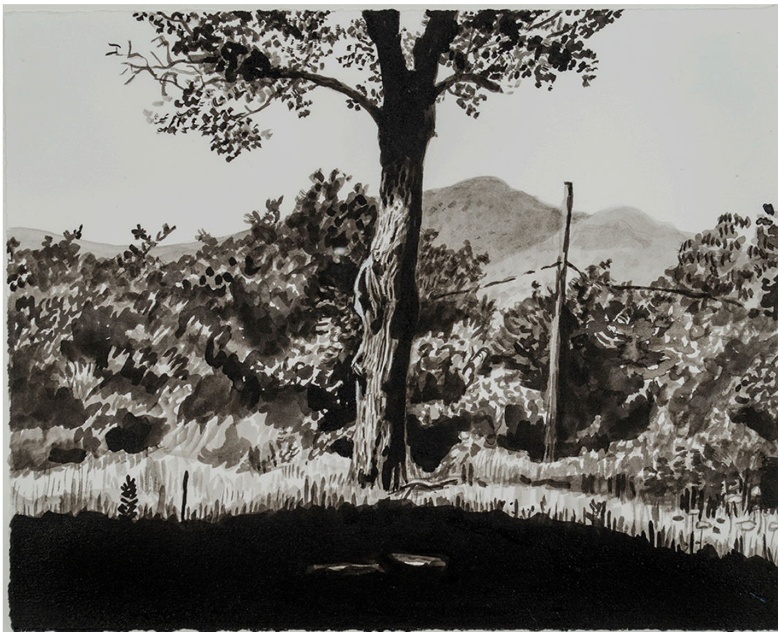
Beaver Lake—Grounds, 2016