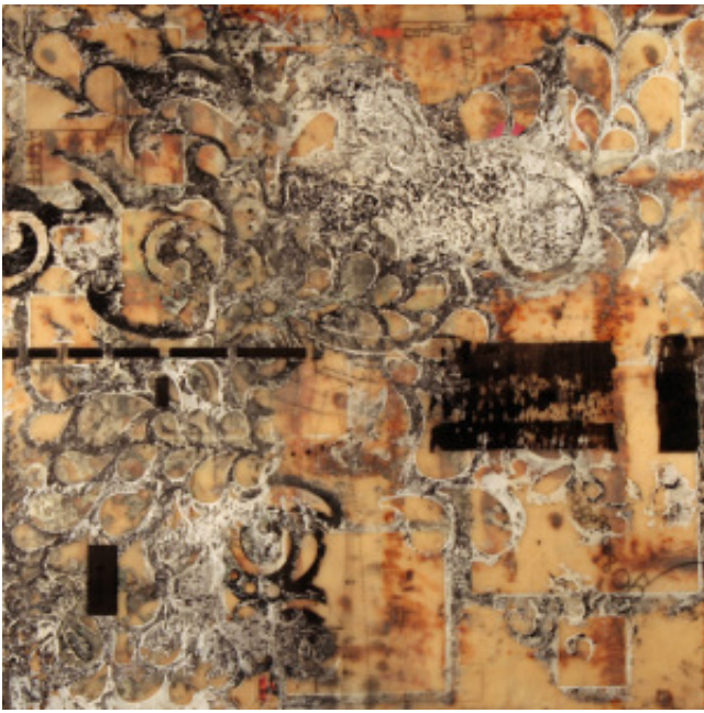
Painted lady 4, @ 2010 Lorraine Glessner

*What is it that you like about encaustic versus other mediums?