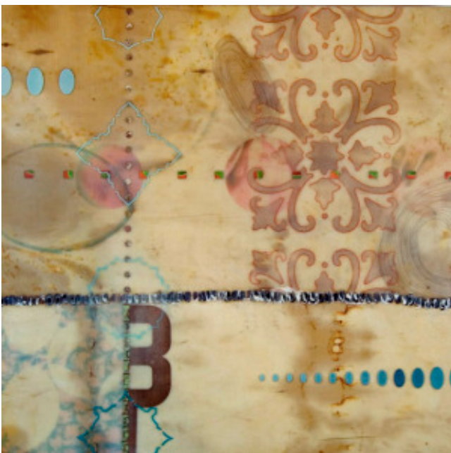
Down sixth street (door), 2010, encaustic, horse and human hair, mixed media on composted and branded silk

I fell in love with encaustic because of its smell; it's luminosity and tactile qualities that I couldn't find with any other medium. Although encaustic is a painter's medium, I don't approach my work as a painter, but as a craftsperson. To me, my work is not about the act of painting, but rather, to develop an engagement with my materials, to perfect my technique and support my content at the same time. Although my ideas have changed somewhat since I began working with encaustic, I always find that I can express myself best using this medium.