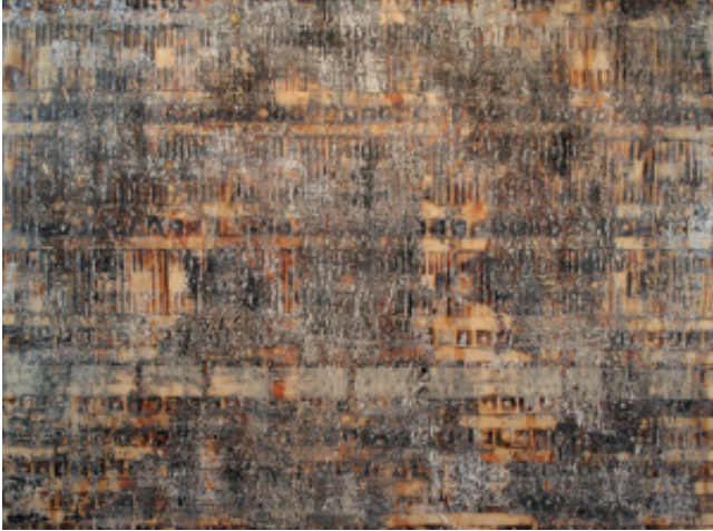
Garage, 2010

Even though we love it, art is WORK. Work really hard, don't get discouraged, believe in yourself and your ideas and never give up.