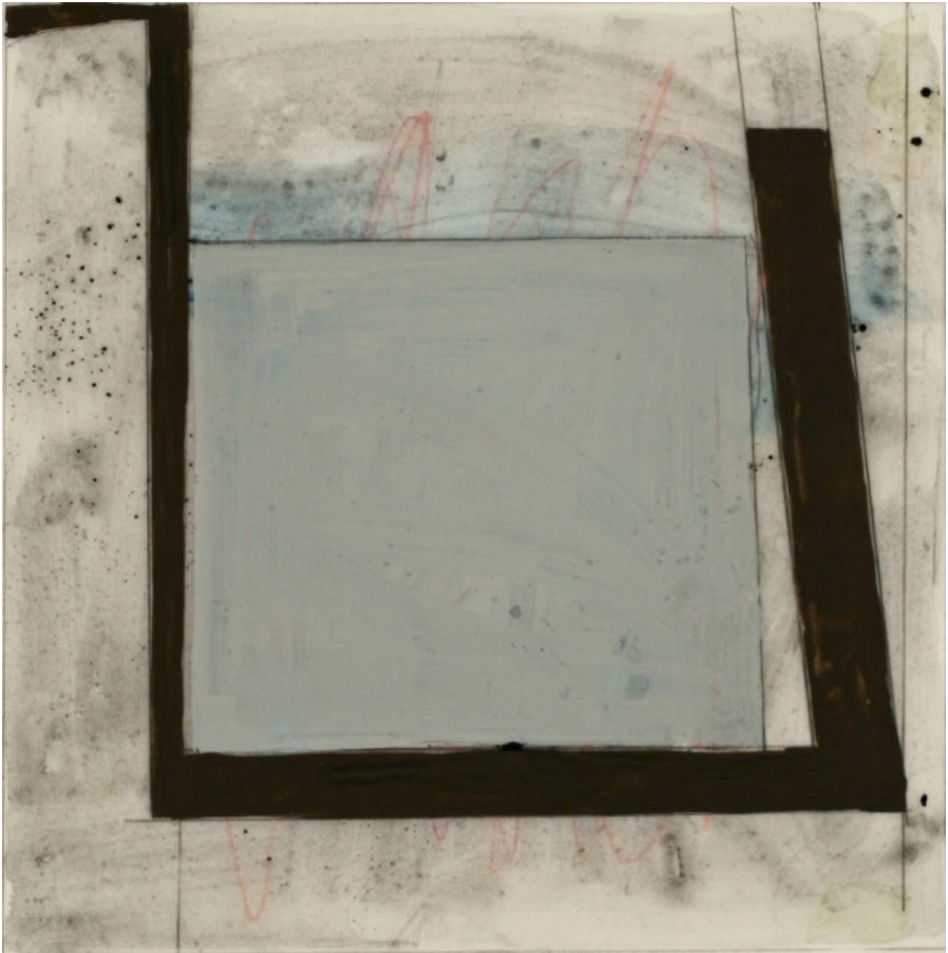
https://sbmacinnis.files.wordpress.com/2013/11/cortile-1-2013.jpg cortile 1 2013

“For over 20 years, Elizabeth Gourlay has developed a practice that, at its heart, is concerned with exploring and developing the possibilities of color and form. Employing a wide range of color palettes from nearly monochromatic to highly polychromatic, her work consistently and rigorously examines ways to broaden the scale of color interaction and expression. Using pure abstraction to articulate her vision, Gourlay’s art is a process of progressively and meditatively layering elements of line and form according to the natural unfolding of an inner vision (dreaming).