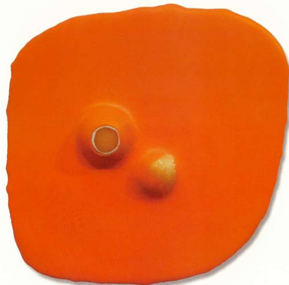
Ruth Hiller NY is a dangerous town #13 | encaustic on panel, 6 x 6 inches