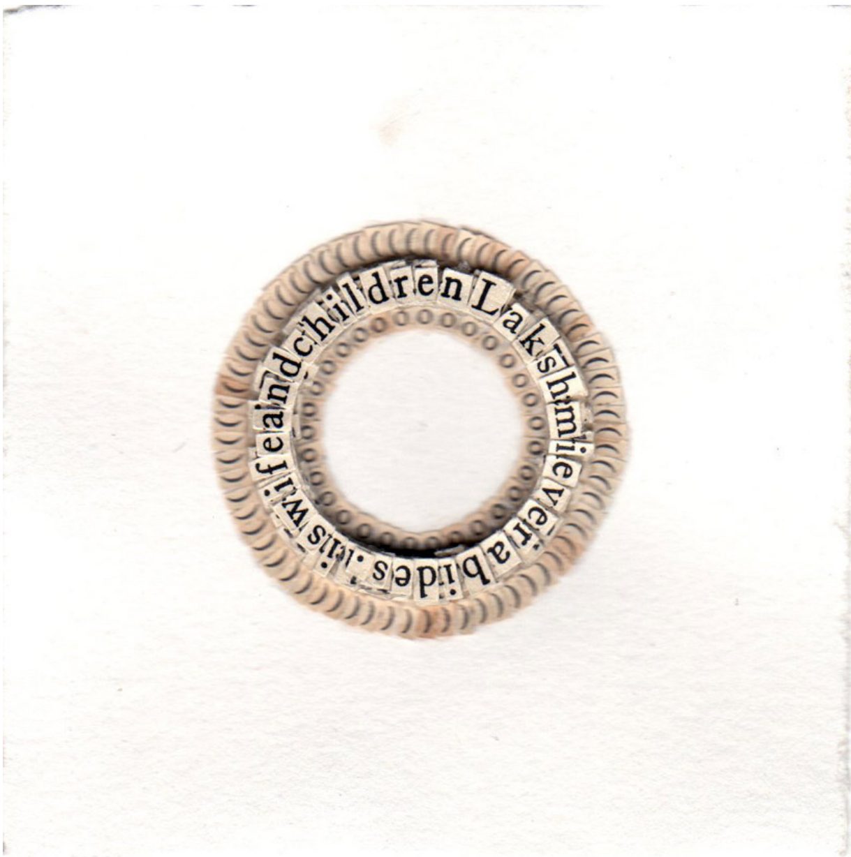
'prayer to lakshmi', 2012 letters cut from the koran 4" x 4"