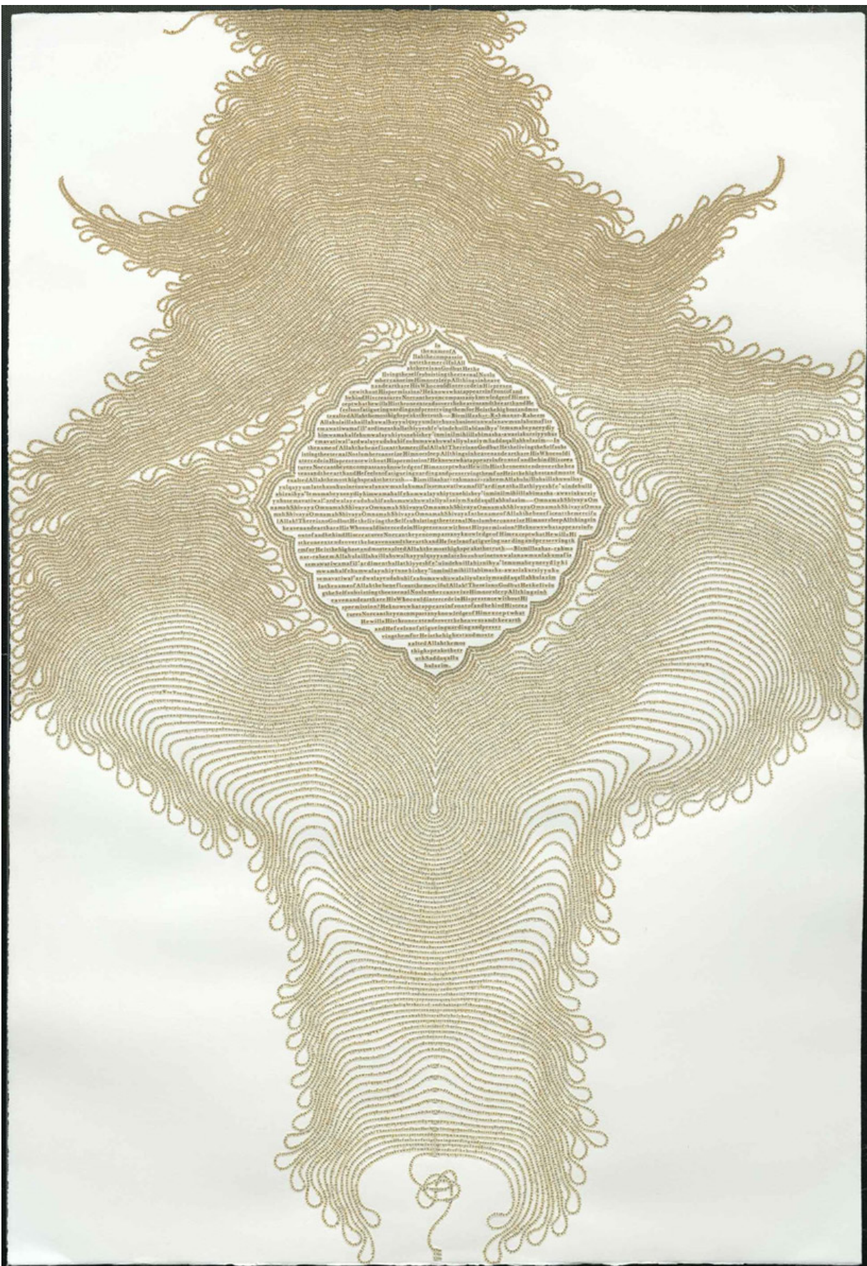
'throne: the book of revelation', 2012 letters cut from the koran 44.5" x 30"

'in 'throne: the book of revelation from the koran', the letters were cut from the koran and used to create the book of revelation. this book makes many references to the throne of god, and a popular muslim prayer is 'ayat al-kursi', or 'the throne verse', which refers to the throne of allah. I included this prayer as the centerpiece in the form of an islamic mandala, in both the english translation and the arabic transliteration. the letters for this