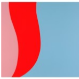
Sound Waves: The Paintings of Ann Walsh