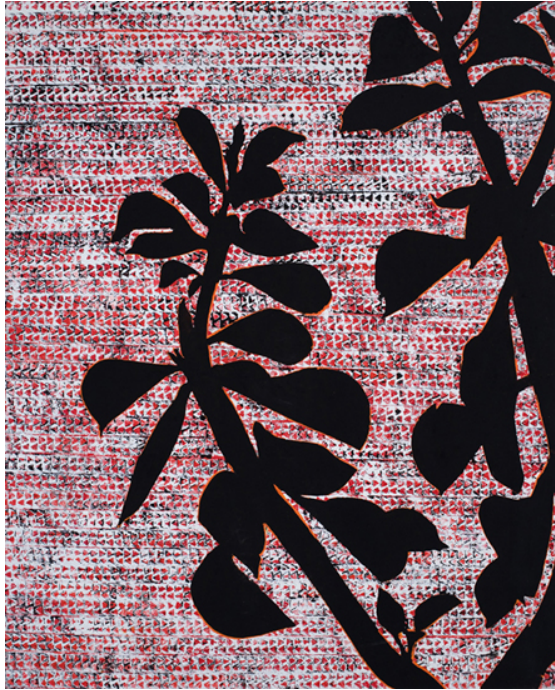
Margaret Lanzetta, Last Two Million , 2008. Oil, enamel, and acrylic on canvas, 60 x 52 inches.

By combining a vocabulary derived from machine parts and surface textures of steel plates with floral patterns and architectural ornamentation, a grittiness emerges. It is as if modern technology and its often-deleterious effects have invaded paradise, which the floral patterns certainly recall. This is underscored through the forms she incorporates, as well as her use of intense, saturated color. The dark lotus floating near the center of Lotus (cayenne) (2005-06), for example, seems on some level to have succumbed to the effects of a poisonous world, while the overlay of rich black, flower-like machine parts in Signal Jumping, Black (2010) or It's All Spiritual (2010) transform the decorative into something far-removed from paradise.