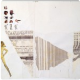
The Figure as Hieroglyph: Nancy Spero's "First Language"