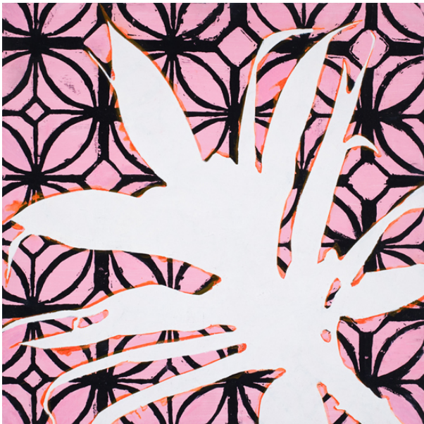
Margaret Lanzetta, Biophilia Eve , 2007. Oil and enamel on panel, 22 x 22 inches.

The clash between symmetry and asymmetry, order and disorder, underscores Lanzetta's vision of reality as a struggle between two opposing forces made of the same, if not identical, stuff. In this sense, the artist undermines the sense of order and decorum normally associated with decorative and architectural patterns. She reminds us that the world has gone awry, and that there is no clear agreement on a resolution. We can neither restore the old order, nor determine how to create a new, widely beneficial order. Even the idea of progress is called into question.