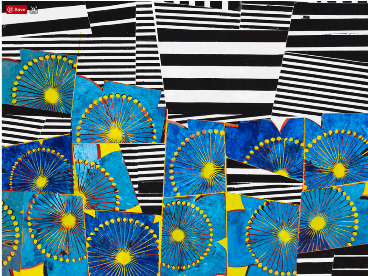
Margaret Lanzetta, Opposite Temperate Zones , 2015, oil and acrylic on canvas, 52 x 62 inches.

28 Feb – 11 Apr 2015 at Kenise Barnes Fine Art in Larchmont, United States