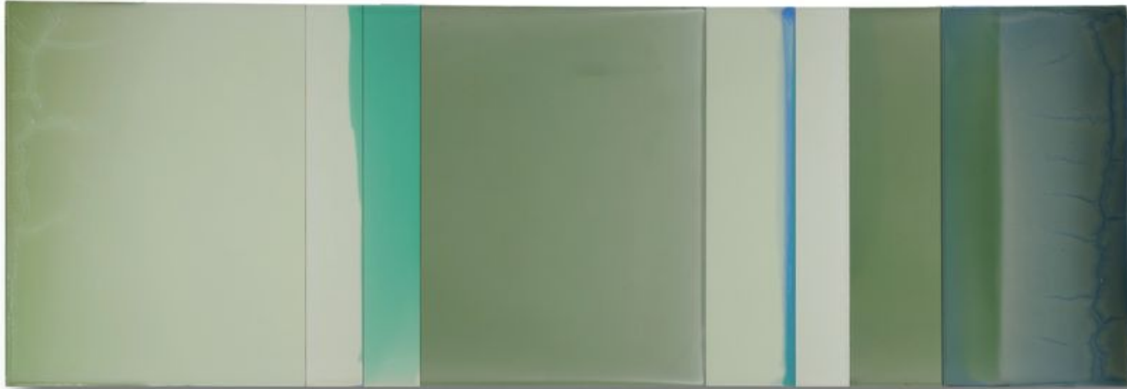
Susan English – Interlude, 2014

quality. Ranging from matte to glossy, English's evocative surfaces form a narrative through color, space and light, by either absorbing it or reflecting it.