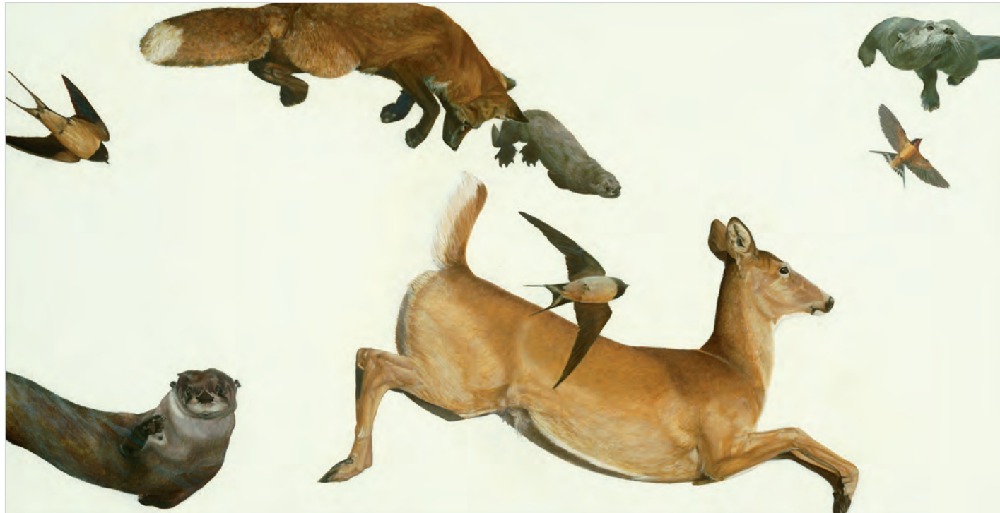
Swallows , North #4 15 x 29.125 inches oil on paper mounted on board 2011 Owls (Detail) , South #6 60 x 122 inches laminated art glass 2012 photograph, Michael Hnatov

Approaching twilight is the setting for Owls (page 8). Quiet compared to the frenzied rush of the animals in Hawks , this panel shows owls in the evening before launching their night flights to hunt. The owls, like nocturnal commuters, counterpoint rushing day travelers. The composition of the tree on the right brings this first cycle to a close, balancing the foliage scene in the first panel Swimmers and suggesting the romantic highlands of the Hudson Valley.