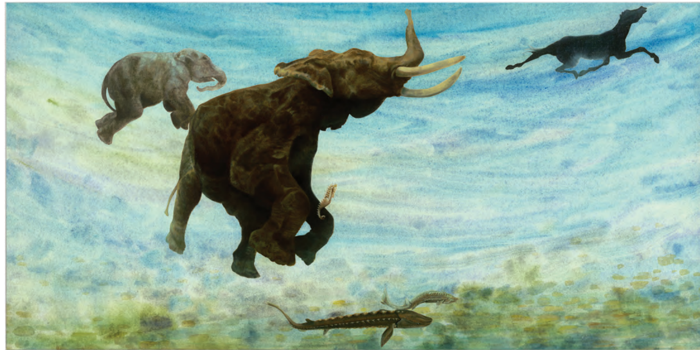
Elephants, South #3 image 10.25 x 20.5 inches, paper 13 x 21.875 inches giclee print, edition 18 2012

In the fall of 2010, I was commissioned by the MTA Arts for Transit and Urban Design, to create the artwork for eleven windows to be installed in the newly renovated Overpass corridors at the Metro-North Railroad Tarrytown Station in Westchester County, New York. Funding for the project was provided by the American Recovery and Reinvestment Act of 2009. I did extensive research on the plants and animals in the Hudson Valley, and the Hudson River itself, and then developed the artwork for each individual panel. These original paintings were digitally reproduced, enlarged, combined, and then layered together to create the laminated art glass panels that were fabricated by Tom Patti Design. Each art glass window is comprised of an object or "creature" layer, and multiple atmospheric background layers, fused together to create the final piece.