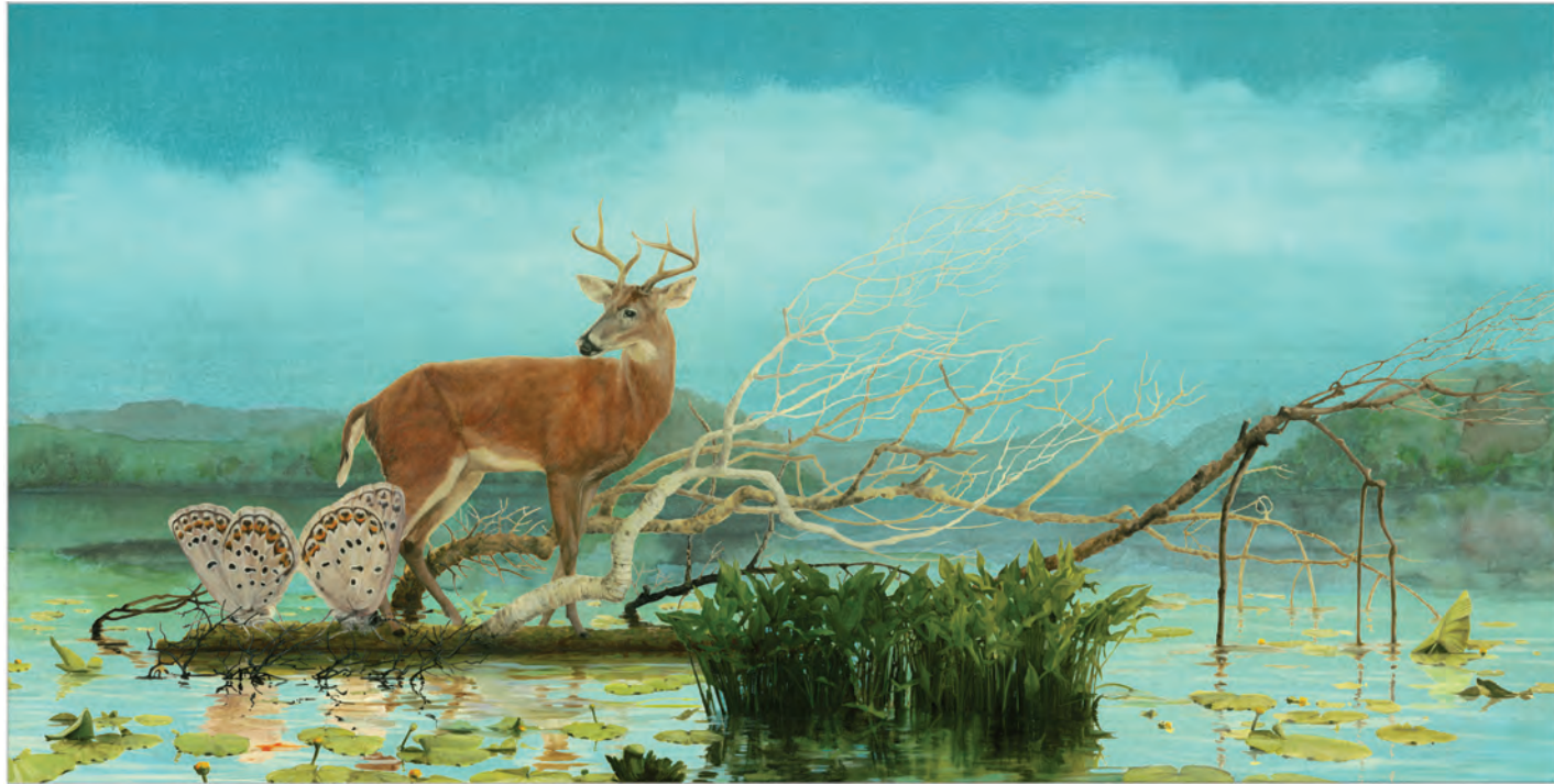
Passengers, South #3 image 10.25 x 20.5 inches, paper 13 x 22 inches giclee print, edition 18 2012 Songbirds, South #1 60 x 112 inches, laminated art glass 2012 photograph, Michael Hnatov