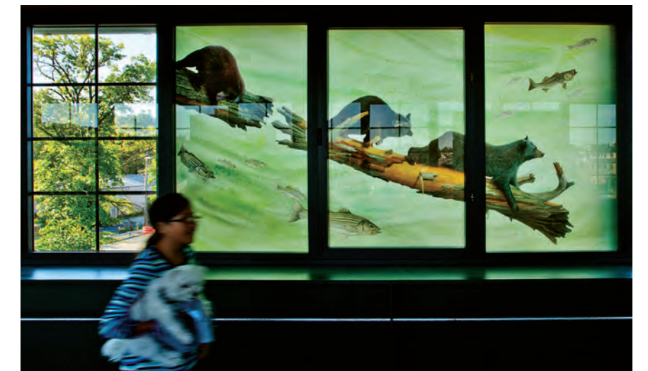
Swallows (Detail), North #4 60 x 117 inches laminated glass 2012