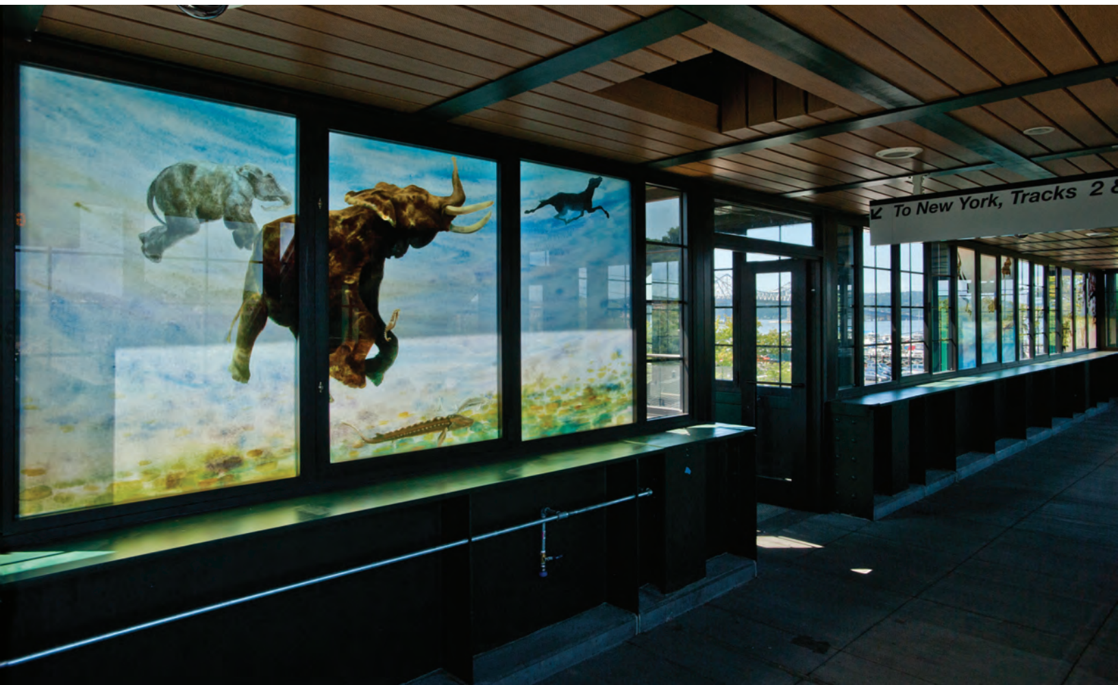
South Overpass long views featuring - Elephants , South #4 60 x 118 inches laminated art glass 2012 photograph, Michael Hnatov Hawks , South #5 60 x 100 inches laminated art glass 2012 photograph, Michael Hnatov Owls , South #6 60 x 122 inches laminated art glass 2012 photograph, Holly Sears