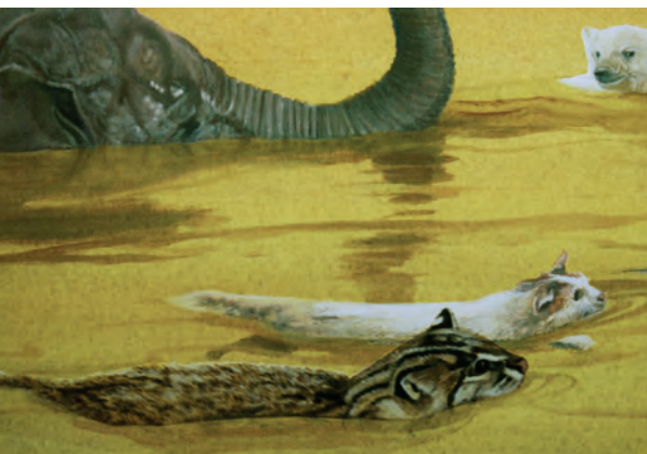
Swimmers, South #1 - sequence showing preliminary paintings, oil on paper and watercolor, giclee print, laminated art glass and art glass detail photographs, Holly Sears