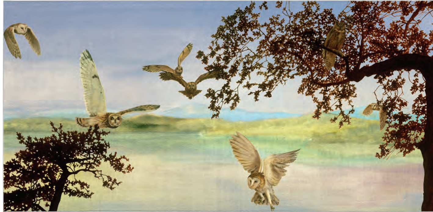
Owls, South #6 image 10.25 x 21 inches , paper 13 x 21.875 inches giclee print edition 18 2012 Swoop, South #2 image 10.25 x 19.125 inches , paper 13 x 21.25 inches giclee print edition 18 2012

of this most famous of America's river valleys. She consulted many books of Hudson River landscapes, though, because she wanted to convey the variety of the Valley's terrain as well as to expand the experience of being here and traveling here.