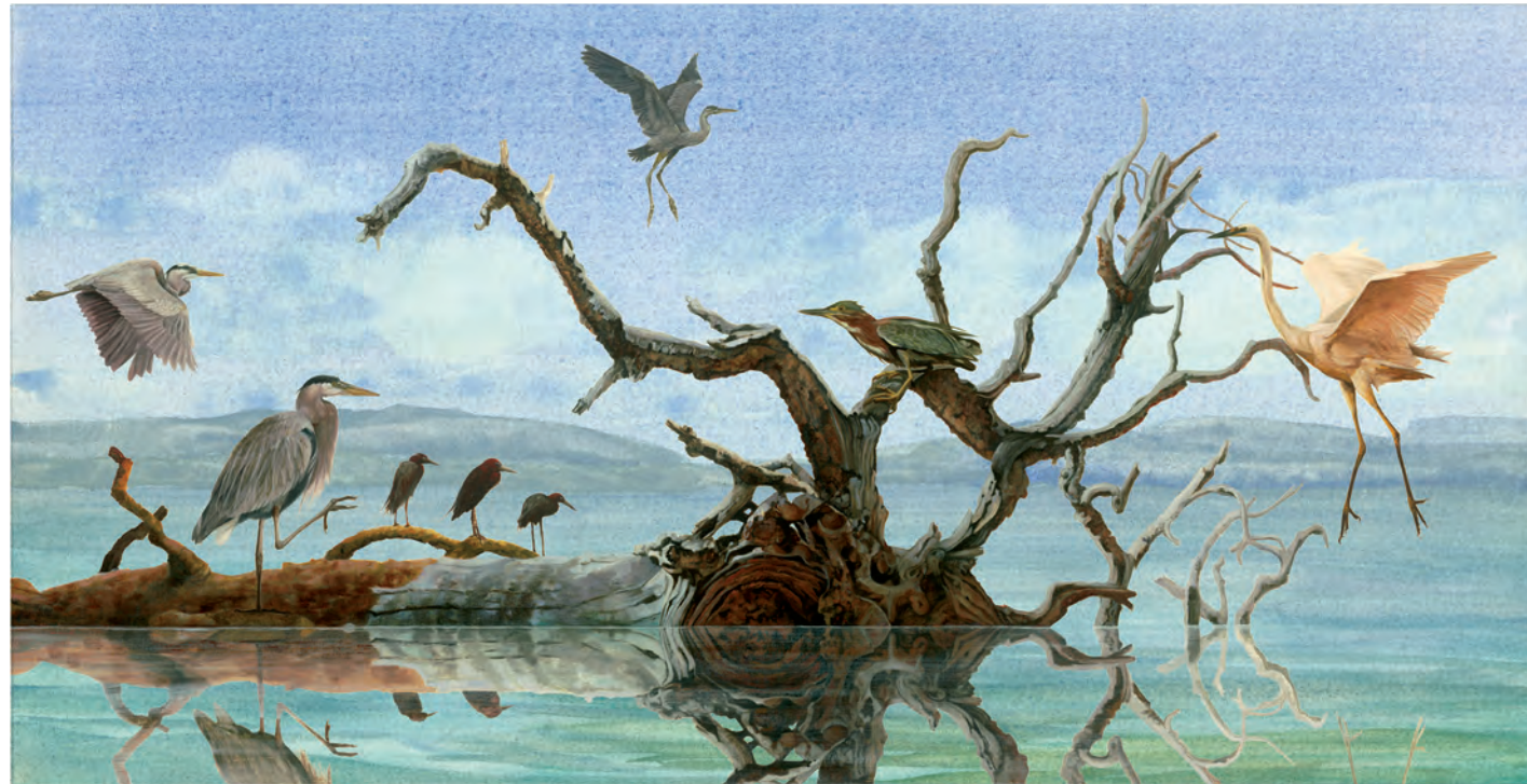
Herons, North #5 image 10.25 x 20 inches, paper 13 x 21.5 inches giclee print edition 18 2012