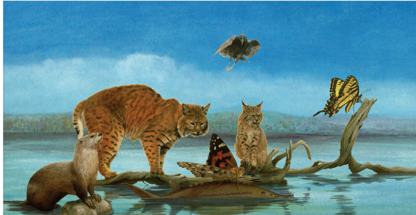
Ride, North #3 image 10.25 x 19.75 inches , paper 13 x 21.75 inches giclee print edition 18 2012 Ride (Detail), North #3 60 x 113 inches laminated art glass 2012

Stillness and action balances see-saw like throughout the panels, varying the rhythm and texture of Sears' work. Created late in the cycle, Swallows (page 12) introduces new compositional boldness. The animals appear ready to leap from the picture frame in a helter-skelter frenzy similar to that of crazed commuters running for a late train, suggesting a snapshot of action caught on the go. The deer bounds through the open sky, and the fox soars as though it has lost control of its moving forward. The panel is named after the smallest creatures of the composition, the swallows, because they are the only animals shown in their natural habitat, while the others are no longer land or water bound, but are being "swallowed" by the sky.