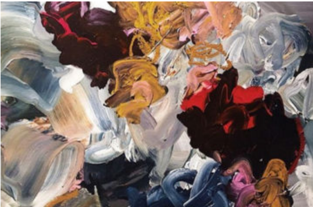
Giant brushstrokes, a lovely studio space, and an up-close shot of a ‘work in progress’. Now, I forgot to get exact examples of the red + grey + white combo that Janna mentioned, but I’m guessing a few of these pieces use that magical recipe: