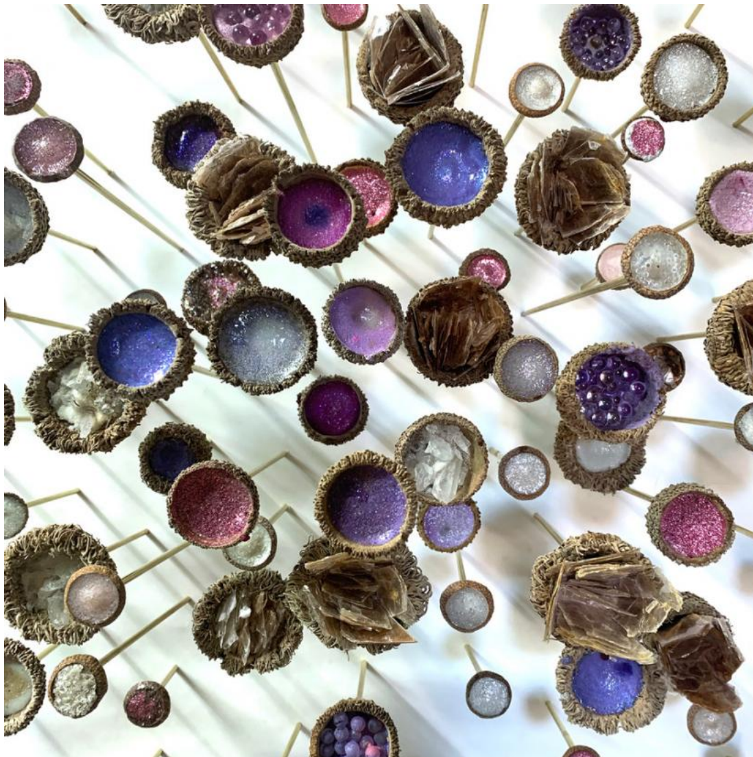
"Julietta," above, is one of a series of wall sculptures by Julie Maren at Kenise Barnes Fine Art in Kent, Conn. This 36 x 36 x 6 inch work is made of acorn tops that are bedazzled with paint, crystal, glass, brass and more. The show opens on June 6.