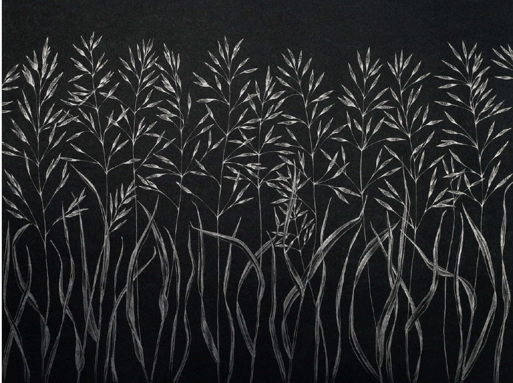
Grasses, 2019. Graphite on paper, 12 x 16 inches. Summer 2019 issue.