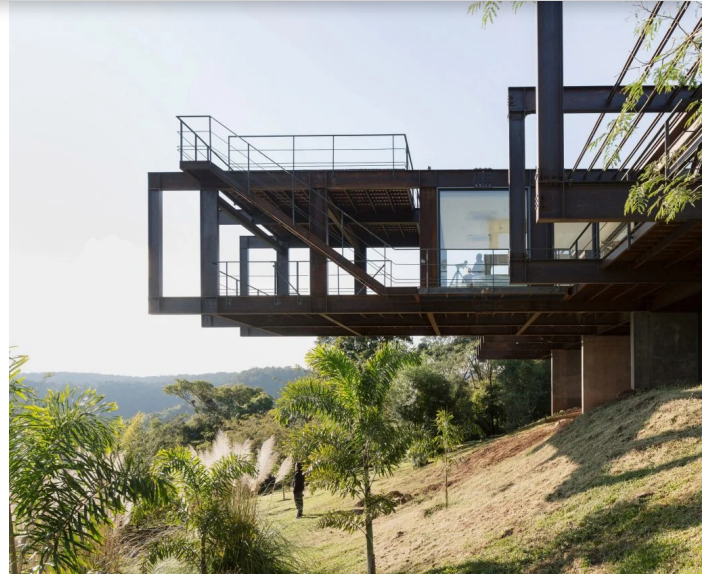
Steel house by Bauen was assembled in seven days on remote mountain site in Paraguay