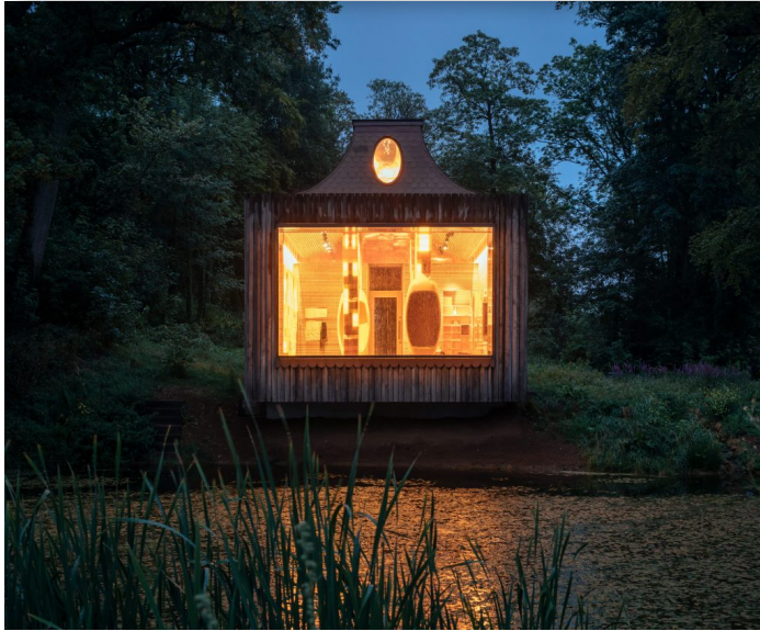
Invisible Studio installs waterside bee house at Somerset hotel