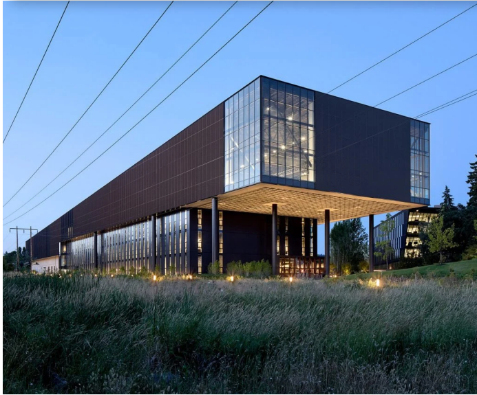
Steel mesh wraps Nike's LeBron James Innovation Center by Olson Kundig