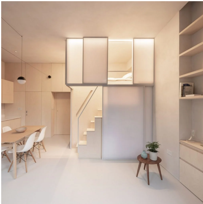
Proctor and Shaw designs London micro-apartment with "sleeping cocoon"