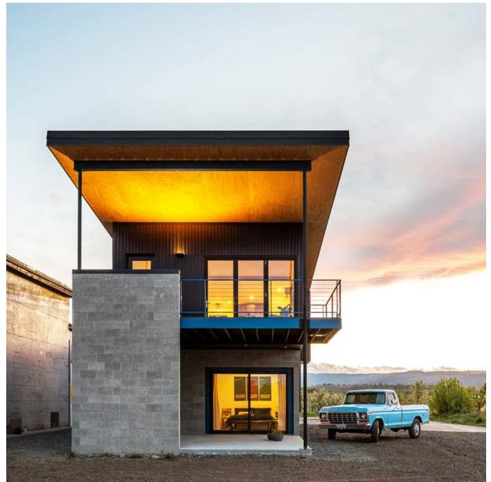
Best Practice Architecture creates Cloud Ranch for a Washington artist