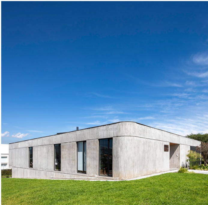
Bernardo Bustamante Arquitectos combines eucalyptus and concrete in Quito home