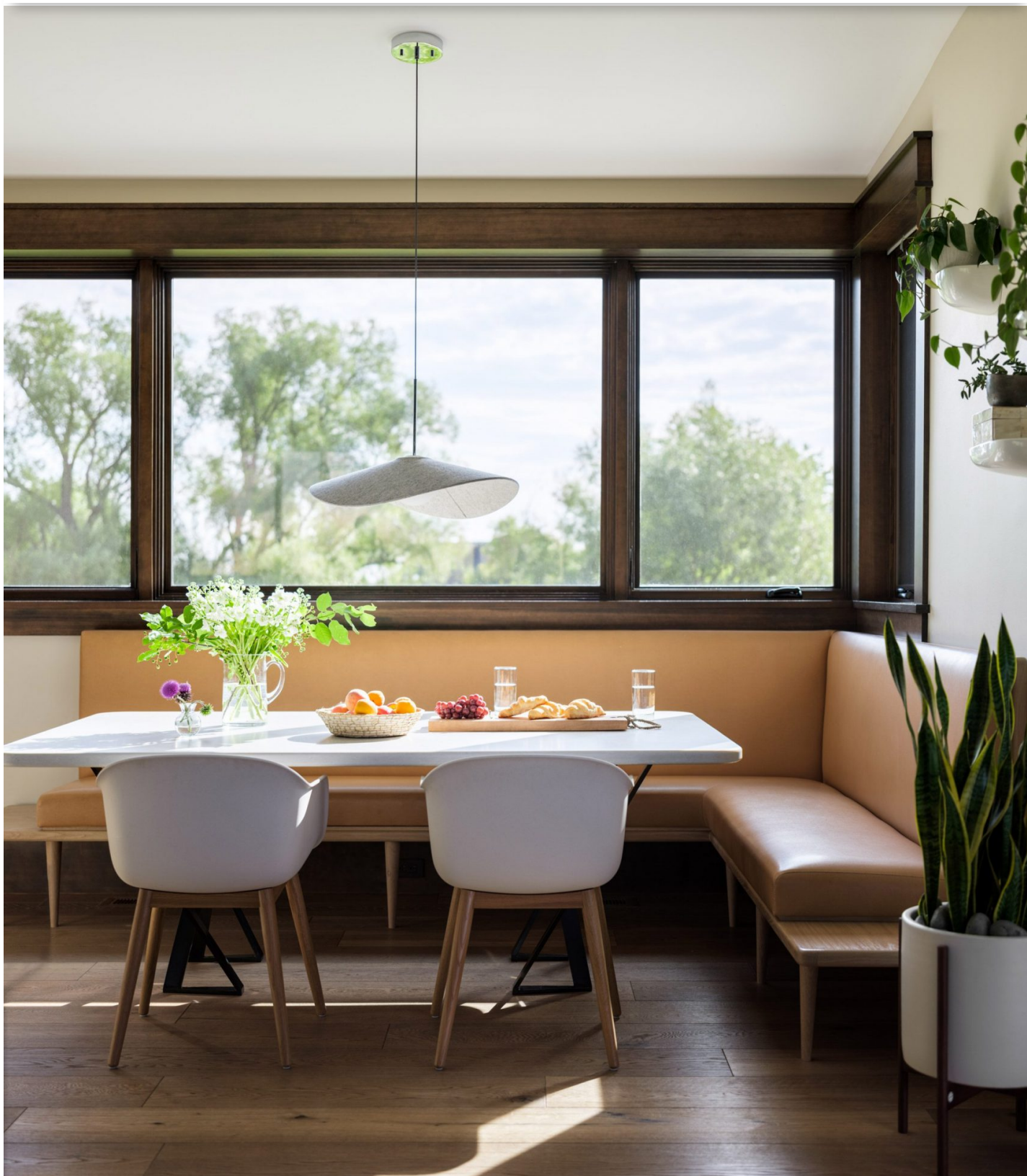
Banquette seating creates a new breakfast table opposite the kitchen

The low-rise building is characterised by a pitched, timber-framed roof, which creates a ski chalet feel.