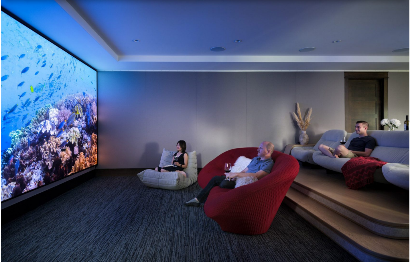
A media room is located on the lower level

"The space was there and we thought it was perfect for a home theatre," she said.