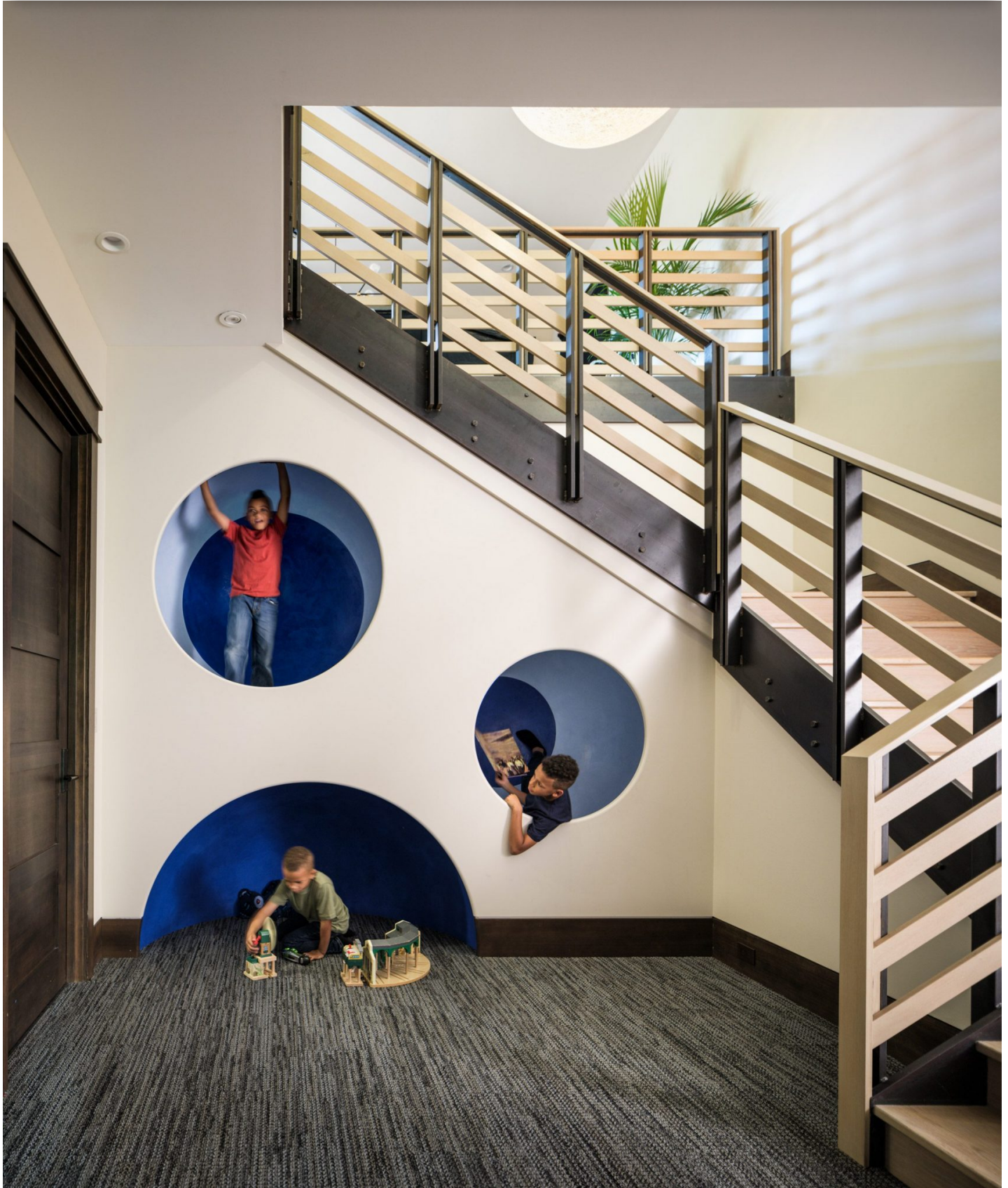
Curved nooks create play spaces below the staircase