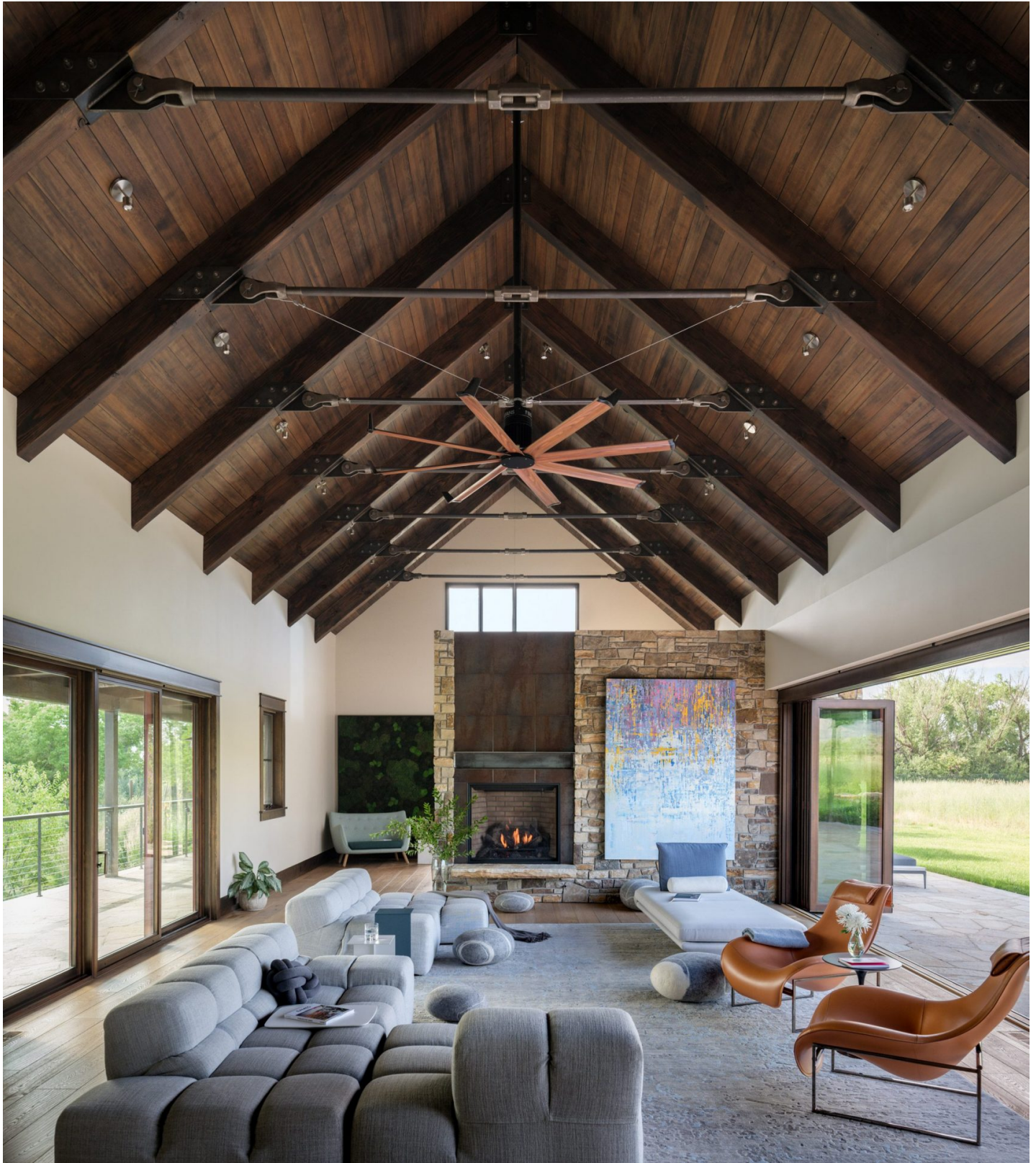
The living room is characterised by a timber roof and large fireplace

Tumu Studio created the new addition as part of a full renovation of the house, known as Flatirons