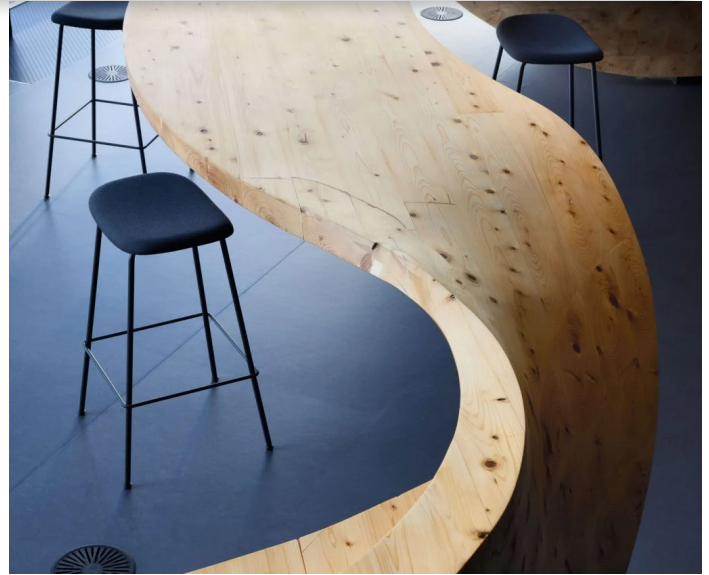
Snøhetta organises Pangaea co-working space around "super furniture"