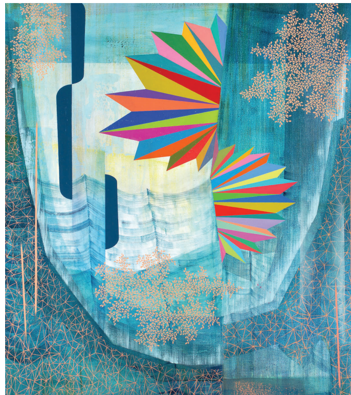
Midnight Sun, oil on linen over wood panel, 48x40in

My approach to teaching goes hand in hand with my daily studio practice and life experience. As a member of an artistic family, it has provided me with unusual insight as to the measure of dedication required of a productive artist and convey that my students understand this level of commitment. A conscientious effort is made through constructive open dialog to create a studio environment where each student is given the opportunity to express themselves, foster meaning in their work, achieve their goals with integrity and mutual respect while exploring their personal growth and potential as an artist. Patience, patience, patience.